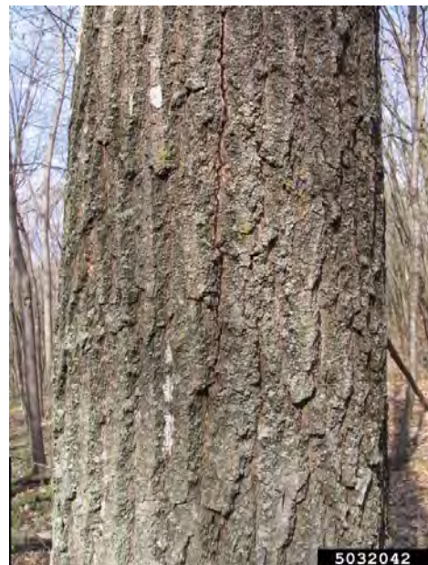
Figure 4. Vertical cracks in bark, indicating presence of spore mats under the bark (John Gibbs, Forestry Commission, Bugwood.org).