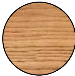
Figure 6. Fresh, moist branch samples with a minimum diameter of 3 cm are the diagnostic focus for this survey.