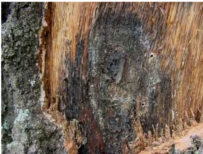
Figure 3. Oak wilt compression mat beneath the bark.

Fungus or “compression mats” are composed of dark mycelia and can occur under the bark of infected trees (Figure 3). Sometimes these compression mats can cause the bark to split (Figure 4) and give off an odour similar to “Juicy Fruit” bubble gum.