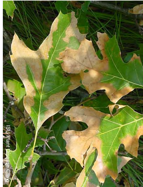
Figure 2. Distinct border on infested leaves (Iowa State University).

Fungus or “compression mats” are composed of dark mycelia and can occur under the bark of infected trees (Figure 3). Sometimes these compression mats can cause the bark to split (Figure 4) and give off an odour similar to “Juicy Fruit” bubble gum.